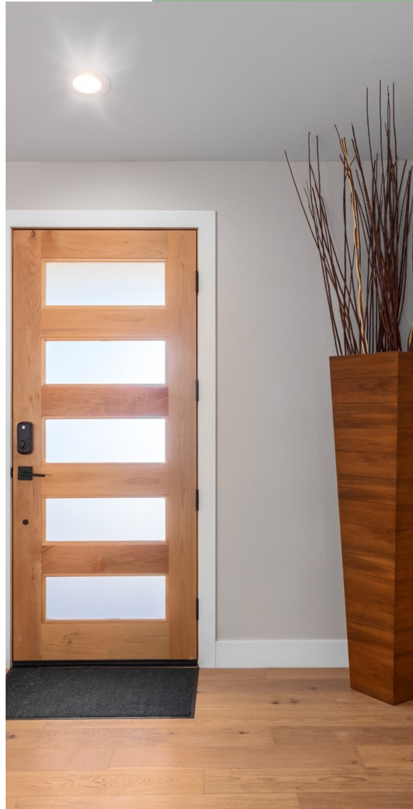
Emery Lane Homes